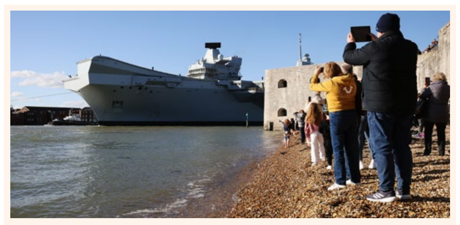
STEPPING UP Aircraft carrier HMS Prince of Wales sails from Portsmouth on 12 February to take the place of HMS Queen Elizabeth in cold-weather exercises off the coast of Norway. Queen Elizabeth was scheduled to play a key role in NATO Exercise Steadfast Defender, but mechanical problems forced her to drop out, and Prince of Wales was rapidly